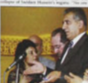
Zakary Khalilid, White House's special envoy to Iraq, talks to reporters at the US-government meeting of Iraqi opposition groups at Fakhri Palace in southern Iraq yesterday